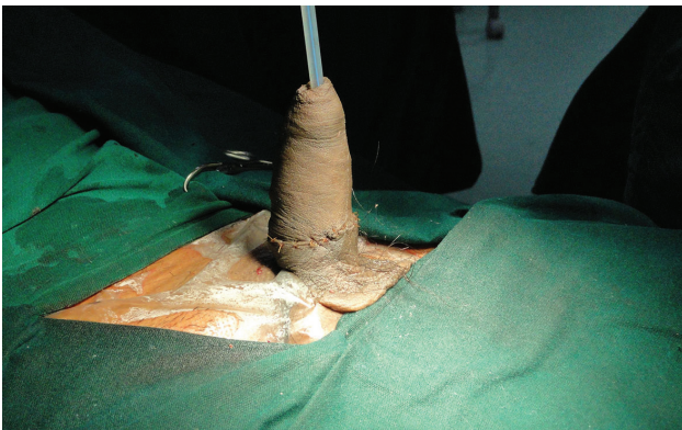
Figure 2. Immediate postoperative appearance.

of patients suffer from undiagnosed psychiatric disorders and around 51% of these have “decompensated schizophrenia”. [1,2] Some patients may be socially isolated due to severe bipolar depression or due to them having religious delusions. [3] Various risk factors implicated in reports worldwide include elderly single males, trans-sexual or homosexual tendencies, or as a guilty feeling for self-committed sexual offences. [2-4]