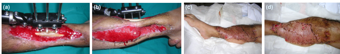
Figure 2. A 32-year-old man who was involved in a motorcycle accident sustained a right tibia fracture with extensive soft tissue and craniofacial injury. Appearance of the right lower extremity at last debridement and 45 days after injury (a, b). Appearance 4 weeks postoperatively, following the latissimus dorsi muscle free-flap surgery (c, d).

( p=0.922 ). Infection requiring intravenous antibiotics was seen in 3 (15%) and 2 (13.3%) patients, partial skin graft failure was seen in 4 (20%) and 2 (13.3%) patients, and hematoma was seen in 1 (5%) and 1 (6.7%) patients in the subacute and delayed reconstruction groups, respectively (Table 2).