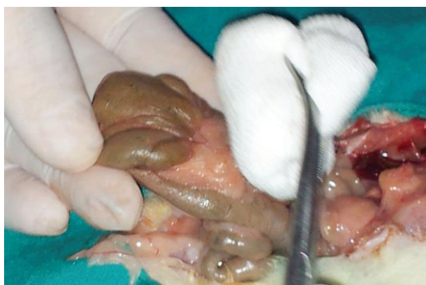
Figure 1. Model of adhesion.

Rats, in all study groups, were kept in the laboratory environment for a week before the experiment and were fed ad libitum with standard rat chow and water. The rats were anesthetized using intraperitoneal 10 mg/kg xylazine HCl (Rompun %2, Bayer - Turkey) and 80 mg/kg ketamin HCl (Ketasol, 50 mg/ml, inj., İnterhas, Türkiye) combination. The animals were placed on the operation table in supine position and the ventral abdominal area was prepared for aseptic surgery. A 3 cm midline incision was made. The cecum was revealed in Groups I and II and after its anterior wall was determined, it was rubbed with a gauze pad held with a clamp until serous punctate hemorrhages were created (Fig. 1). The parietal peritoneum was then held with a clamp 1 cm right lateral to the incision and was sutured with 3/0 polyglactin 910 (Vicryl, Dogssan, Trabzon-Turkey). The abdomen was closed properly after 50 mg/kg alpha lipoic acid (Thioctazid purchased from Sigma-Aldrich Chemical Co., St. Louis, MO, USA) was administered intraperitoneally in Group I and with no drug administration in Group II. Only laparotomy with a midline incision was performed in Group III (Sham group). After completion of all transactions in each group, the operation site was closed properly and the animals were put in