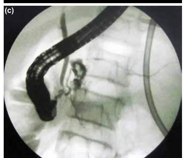
Figure 1. (a) Computed tomography of abdomen suggesting suspected breach in the pancreatic neck and hypodense non-enhancing peripancreatic collection. (b) Magnetic resonance cholangiopancreaticography showing near complete transection at the head-neck junction of the pancreas and normal distal main pancreatic duct. (c) Endoscopic retrograde cholangiopancreatography revealing leak at the genu.

cm collection in the lesser sac, and distal main pancreatic duct was normal (Fig. 1b). Ultrasonography-guided external drainage of peripancreatic collection was performed. ERCP was done on day 7 of trauma, which revealed leak at the genu (Fig. 1c). Stenting of the pancreatic duct was completed using 5 F stent. Patient's serum amylase showed decreasing trend. Oral diet was initiated. External drain output progressively decreased. After confirming absence of collection on ultrasound, drain was removed. ERCP with stent removal was performed at 6 weeks. Patient was doing well on follow-up.