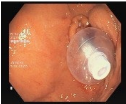
Figure 3. Inflated balloon of percutaneous endoscopic gastrostomy replacement tube

Fr diameter PEG replacement tube (Galena, Hangzhou Fushan Medical, Shenzhen, China) was passed through the stoma over the guide wire and inflated the balloon of the replacement tube. The follow-ups of the patients were uneventful.