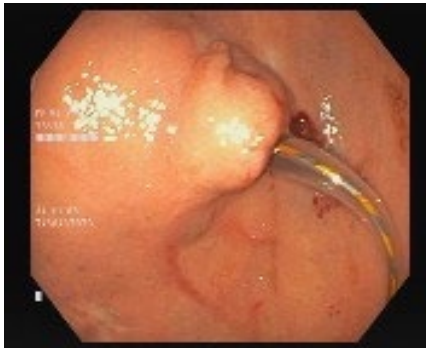
Figure 2. Bougie dilatation of the stoma through 9-mm Savary-Gilliard bougie