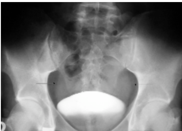
Fig. 2. Frontal retrograde cystogram; there is a suspicion of contrast medium extravasation on the right and left of the urinary bladder (arrows).

Plain chest X-ray showed a loss of sequence of left diaphragmatic border (Fig. 1), while pelvic X-ray was normal; further evaluation with new series