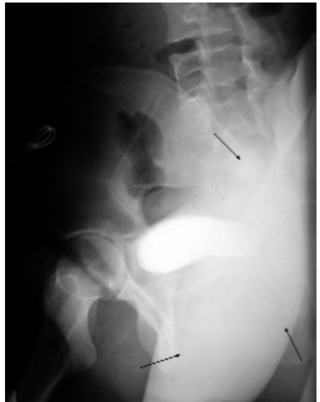
Fig. 3. Profile retrograde cystogram demonstrated extravasation of contrast medium (arrows).

Because of the diagnosis of intra-peritoneal bladder rupture and equivocal signs of peritoneal irritation and since diaphragmatic rupture could not be excluded, an exploratory laparoscopy was per-