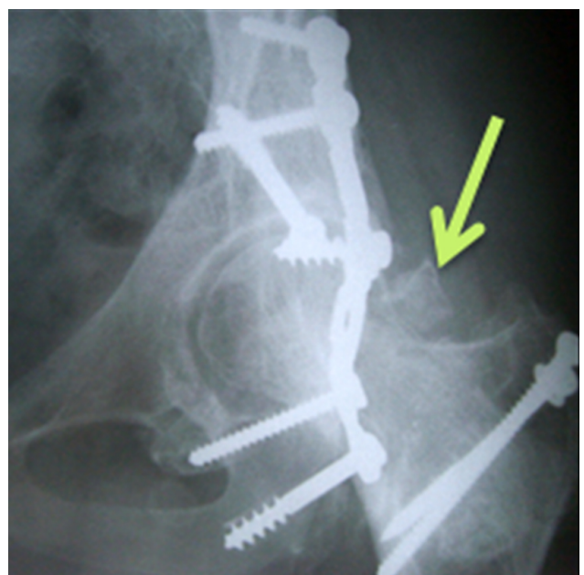
Figure 1. Heterotopic ossification (shown with arrow).

Clinic outcomes were worsened by increasing at the operational time ( r=0.318 p=0.001). When the operational time was categorized as 0–3 hours, 3–6 hours and >6 hours, it statistically significantly affected clinical outcomes of the groups (chi-square=15.752 p<0.001). The relationship of the groups with each other was examined in order to find out which group caused significant effect. An operational time between 0–3 hours and 3–6 hours did not significantly affect clinical outcomes (Fisher's<0.999). However, there was a statistically significant correlation between clinical outcomes of the patients with an operational time of 0–3 hours and >6