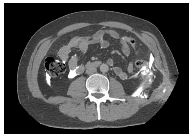
Figure 5. Abdominal computed tomography scan showing a patient with positive tractography. Leaked contrast agent through peritoneal defect is clearly seen around descending colon, ascending colon, and small intestines.

Table I. Demographics and some features of the patients phy