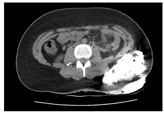
Figure 4. Abdominal computed tomography scan of an obese patient with retroperitoneal hematoma showing negative peritoneal violation. Contrast agent is clearly seen as white.

Left kidney (16%) and descending colon (16%) were the most common sites sustained injury. Resection and anastomosis for colon perforation was performed in four patients. Also, in one of them, splenectomy was added because of grade 3 spleen laceration. Furthermore, nephrectomy was performed in two patients due to grade 3-4 laceration, splenectomy, and diaphragmatic laceration repair in one patient. Of the remaining three patients, two were followed for grade I-2 left kidney injury, and one patient for retroperitoneal hematoma; but they did not require additional interference, and were also discharged after 24 hours of observation. Patients who were operated recovered without complication, and none of the conservatively followed patients represented with missed injury. Summary of patient demographics is presented in Table 1.