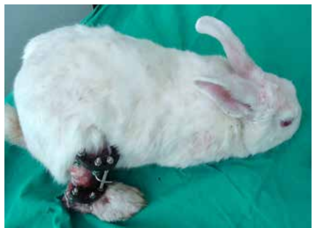
Figure 2. Circular external fixator applied to the fractured tibia.

Side-ported needle was connected to ICP monitoring system (Stryker Intra-Compartmental Pressure Monitor; Stryker Corp., Kalamazoo, MI, USA), which consists of recording box, switch, numerical display, single-use pre-filled syringe of physiological saline, and pressure transmitter. ICP monitoring of