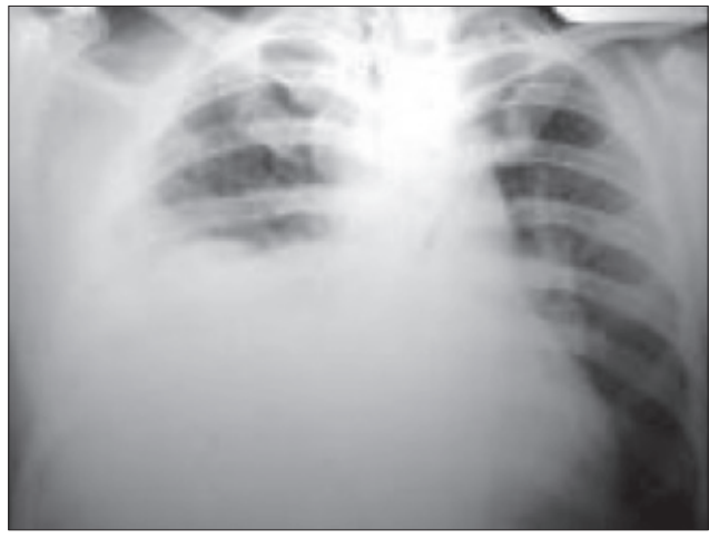
Fig. 1. Chest radiograph showing gross elevation of the right hemidiaphragm.

On admission, the patient had dyspnea and tachypnea (respiratory rate 30/minute) and saturation in room air was 92%. The clinical examination revealed no obvious external injury to the abdomen or thorax. The trachea was found to be in midline, and air entry was diminished in the right lower zone on auscultation. Repeat chest radiograph showed grossly elevated right hemidiaphragm (Fig. 1) compared to the chest radiograph taken immediately after the trauma, which showed only a slight elevation. Arterial blood analysis revealed respiratory alkalosis with mild hypoxemia. Differential diagnosis of hemothorax, pulmonary thromboembolism, pulmonary contusion, basal atelectasis, and collapse of the right lower lobe were considered. A computed tomographic (CT) scan was done, which showed discontinuity of the right diaphragm, presence of the liver in the right paracardiac