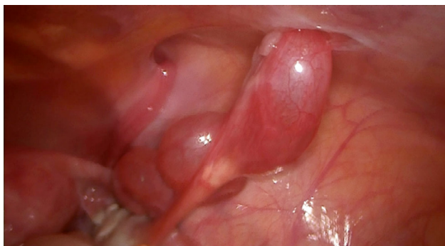
Figure 3. Herniated right fallopian tube in 5 mm trocar site.

polypropylene suture. The patient, who had no postoperative complications, was discharged on the first postoperative day. Patient's consent was obtained for this study.