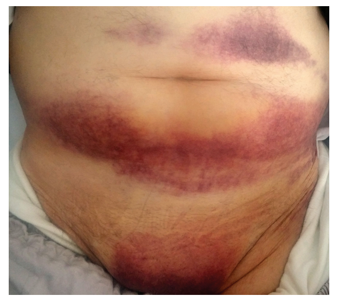
Figure 1. Ecchymosis in the upper, lower, and pelvic abdominal area.

I). Abdominal ultrasonography (USG) was initially performed for 8 patients, and then all 27 patients underwent abdominal computed tomography (CT). According to the results of the CT scans, which revealed the size and localization of the masses, the majority of cases were classified as Type III (n=14, 51.8%) (Fig. 2a-c). The largest hematomas revealed by the CT scans averaged 130±68 (40–300) mm. The majority of hematomas were located in the right quadrant of the abdomen (n=16, 59.2%). The patients' radiological results are summarized in Table 2.