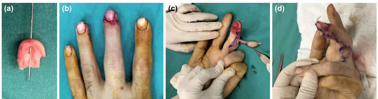
Figure 1. (a, b) Amputated part was prepared and fixed using Kirschner wire. (c) Flap was elevated. (d) Flap was sutured and donor area was closed using the skin of the amputated part.

In 5 patients, replantation procedures failed. In these failed patients, after the removal of necrotic tissues, the stump was either repaired or reconstruction with a flap was applied. The lengths of replanted fingers were approximately 2.3 (range, 0–10) mm shorter than the corresponding finger of the contralateral hand. As for nail deformities, 1 patient