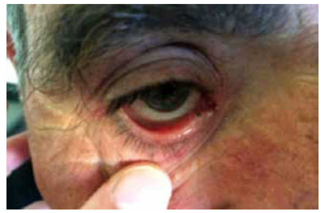
Figure 4. The patient with Monoka tube attached for 2 years.

Avulsive traumas made up 66% (n=27) of injuries in study group, while 34% (n=14) were direct (penetrating) injuries. Classification made based on etiology of trauma revealed that among 41 patients, 16 suffered canalicular damage as result of blow/punch, 10 patients were wounded with sharp object, 5 patients fell from height, 4 patients were injured in traffic accident, 3 fell from tree, 2 suffered animal attack, and I patient "was scratching his eyelid after dacryocystorhinostomy" (Figure 1).