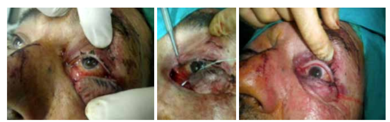
Figure 3. Detection of distal end via pigtail probe.