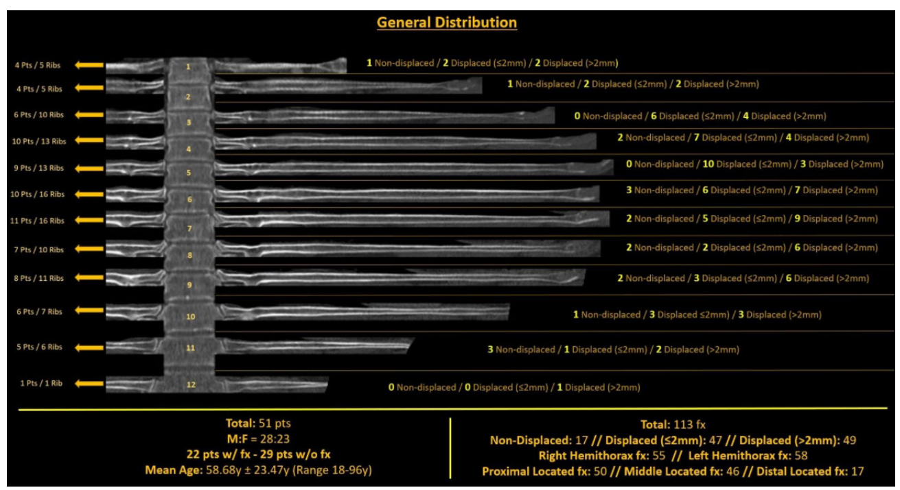
Figure 2. General background data on the distribution of fractures for each rib.