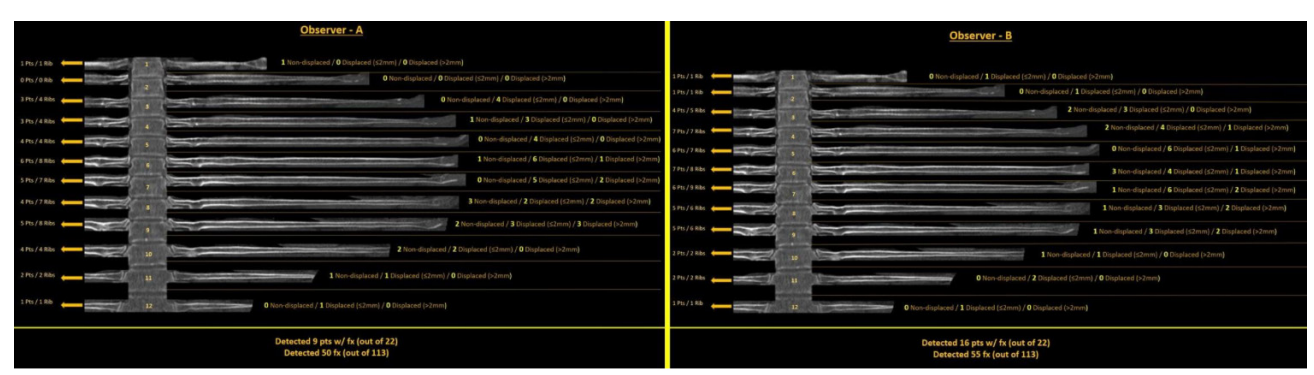
Figure 3. Distribution of detection and displacement by observers for each rib.

Data were summarized as mean \pm standard deviations or median (range) for continuous variables, depending on the distributional properties of the data. Normality of variables was tested using the Kolmogorov–Smirnov test. Mann–Whitney U-test was used for comparison of evaluation times. Inter-observer agreement for fracture detection per patient was assessed with weighted kappa ( \kappa ) analysis. Categorical variables were evaluated with the Chi-square test or Fisher's exact test when applicable. For all tests, a two-tailed P < 0.05 was considered statistically significant.