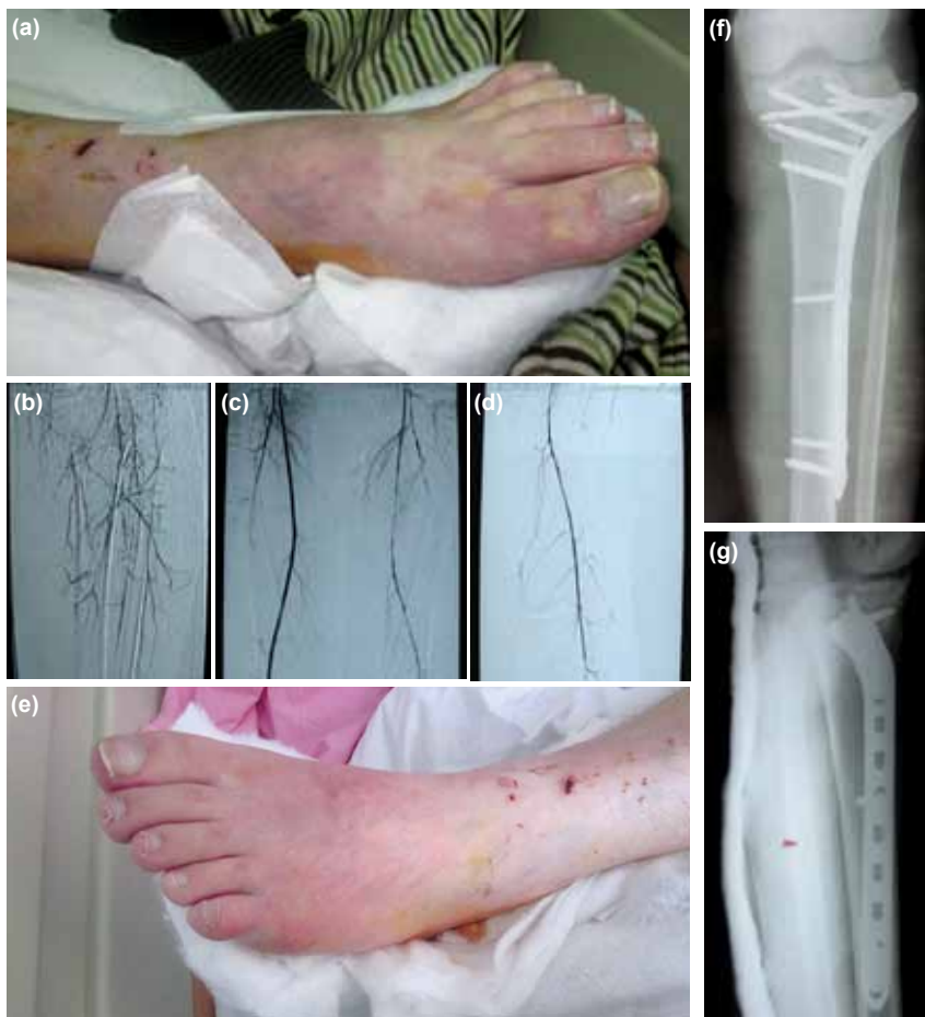
Figure 2. (a) Ischemic changes in the left foot. (b-d) Angiograph showing widespread arterial vasospasm in the left lower extremity. (e) The left foot after treatment. (f, g) Fixation of the tibial plateau fracture.

which determined widespread vasospasm from the proximal femoral artery extending to the distal arteries. Differential diagnoses of Buerger disease and Raynaud phenomenon were considered because of the angiographic images, but the clinical table and the angiographic findings differed from that of diffuse spasm. [16] The occlusion in the leg arteries in Buerger disease is seen as collateral formation, with the occlusion extending in a corkscrew fashion along the arteries. The occlusion in the proximal arteries was normal and widespread spasm was not seen. Raynaud phenomenon is more often seen in upper extremity arteries and usually responds to the application of intra-arterial vasodilator. Generally, the symptoms do not cause an acute deterioration. [17] In the current case, as arterial vasospasm occurred on the 10th day, and the diagnosis of traumatic vasospasm was made. When the anamnesis was examined in greater depth, it was learned that, for approximately 10 years, the patient had been taking 4-5 tablets ergotamine tartrate (0.75 mg) daily due to migraine in an irregular and uncontrolled manner.