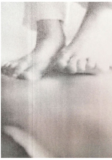
Figure 1. Back walking massage.