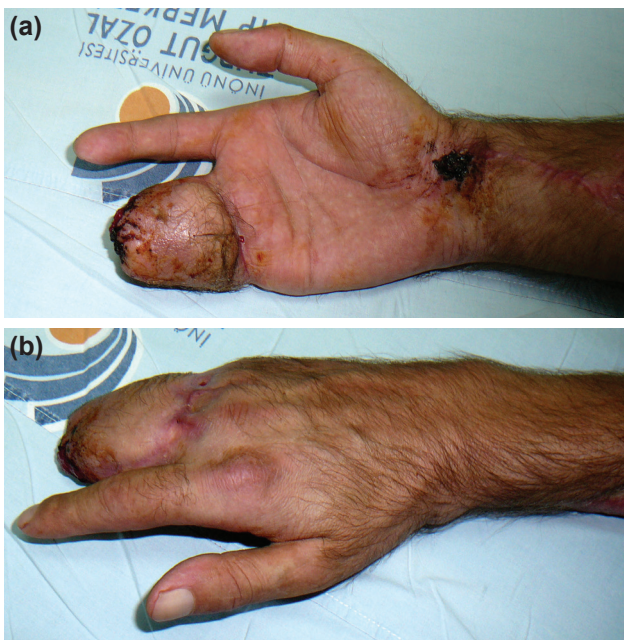
Figure 2. Late view showing the hand following the pedicle division (a) volar view (b) dorsal view.

tact in the donor bed. The incision pierced the muscle bellies and reached the space between the flexor carpi radialis and brachioradialis. At this point, perfusion of the flap was observed after releasing tourniquet. No nerve repair was performed. The flap was then transferred and wrapped around the three fingers and donor side was skin grafted (Fig. 1c). The area between skin-grafted donor site and pivot point was primarily closed in a zig-zag fashion. A below elbow splint was placed for 3 weeks. At the third postoperative week, the flap and donor site uneventfully healed (Fig. 2a and b). Then, the pedicle was ligated and severed at the end of 3rd postoperative week. During the postoperative period, joint stiffness occurred at the wrist and metacarpophalangeal joints, which was resolved with early physical therapy. Nevertheless, 90% range of motion at the MP joint of the degloved fingers was achieved, and no functional deficits occurred at the wrist joint. At the 3 rd postoperative month, fingers in the flap bulk had a good range of motion.