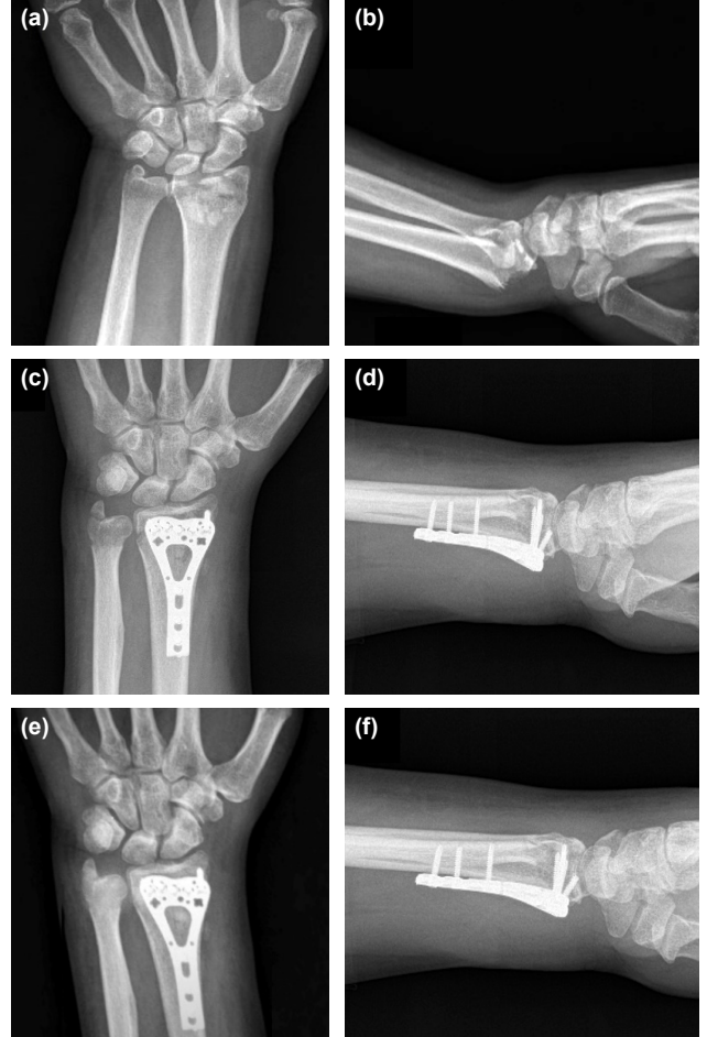
Figure 2. (a, b) Intra-articular distal radius fracture pre-operative antero-posterior (ap) and lateral view. (c, d) Early post-operative ap and lateral view fixated by volar locking plate. (e, f) Ap and lateral view in the first operative year

All operations were performed under regional or general anesthesia. The same type of hinged BEF was applied to all patients. Two Schanz screws were sent percutaneously under the scope from proximal of the fracture to the radius and from distal of the fracture to the second metacarpal. Then, external fixator was locked following closed reduction under scope. Reduction was checked under the scope. The fixation