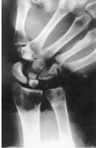
Fig. 1. Radiograph of the wrist with increased gap between os scaphoideum, trapezium and trapezoideum after sectioning of the STT interosseous ligament on PA view.

mentum scaphotrapeziotrapezoideum (STT) resulted in instability, detected by an increased gap between os scaphoideum, trapezium and trapezoideum on ulnar deviation (Fig. 1).