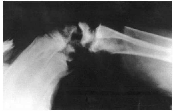
Fig. 2. Os capitatum was subluxated on os lunatum when os capitatum was pushed dorsally after sectioning RSC ligament.

deviation but os lunatum moved dorsally and os scaphoideum showed volar flexion on dorsiflexion and scapholunate (SL) gap was increased and os capitatum was subluxated when os lunatum was forced to dorsal translation. A typical lateral radiographic view of capitolunate (CL) instability is shown (Fig. 2). While there was a dorsal intercalated segment instability (DISI) deformity on lateral view, PA radiograms demonstrated SL gap (Fig. 3). All these signs were returned to normal with the repair of the RSC ligament.