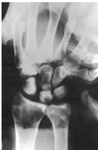
Fig. 3. SL gap was demonstrated on PA view after sectioning RSC ligament

Sectioning the ligamentum triquetrohamatocapitatum (THC) resulted in capitoamate (CH) dissociation. After sectioning the ligamentum radiolunotriquetrum (RLT), capitate articular surface of lunate moved volarly and volar intercalated segment instability (VISI) was seen on lateral view. It was not until the ligamentum radioscapohcapitatum (RSC) was sectioned that the change of alignment of carpal bones on movement was observed. No change was present on ulnar or radial