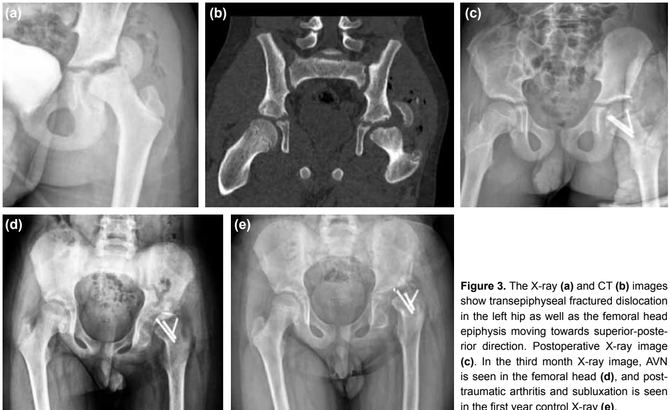
Figure 3. The X-ray (a) and CT (b) images show transepiphyseal fractured dislocation in the left hip as well as the femoral head epiphysis moving towards superior-posterior direction. Postoperative X-ray image (c). In the third month X-ray image, AVN is seen in the femoral head (d), and post-traumatic arthritis and subluxation is seen in the first year control X-ray (e).

reduction. After the transepiphyseal fracture had been fixed by three retrograde Herbert screws, the hip was reduced. Injured capsulolabral complex was repaired with anchor suture (Figure 3c). Patient's hip was stabilized with hip abduction device for two months. He was permitted to walk with partial weight bearing at the eighth week and full weight bearing in the tenth. At the third month follow-up, AVN occurred in the femoral head (Figure 3d). Posttraumatic arthritis and subluxation were determined at the first year follow-up (Figure 3e). Furthermore, there were 1.5 cm leg length discrepancy and restriction and pain in his hip movements. Harris hip score of this case was 61.