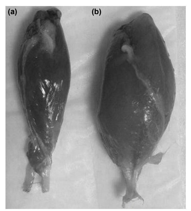
Figure 1. The left (a) and right (b) gastrocnemius muscles of a subject from Group 4.

Mean values and standard deviations were calculated for numerical data. F test was used to determine the distribution of the numerical data, and Student's t-tests were used to compare numerical data of the groups. Mann-Whitney U test was used to compare the ordinary data. It was accepted as significant if p<0.01.