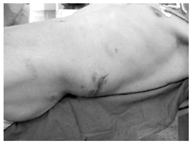
Fig. 1. Dermabrasion and swelling of the left flank during physical examination.

logy. Abdominal computed tomography (CT) was performed to evaluate the herniation site and to explore other retroperitoneal and intraabdominal visceral injuries. CT revealed intestinal loops herniated from the left lumbar region (Fig. 2). The patient was operated for the diagnosis of traumatic lumbar hernia. With the skin incision, we detected an 8 cm defect between the tenth rib and external oblique muscle and the herniation of intestinal loops from this defect. Peritoneum was closed with chromic catgut and a 10x10 polypropylene patch was placed over the defect with significant overlap on all sides. Patch was secured in an extraperitoneal location with full-thickness polypropylene sutures. Skin was closed following Hemovac drain insertion under skin. The drain was removed on the third postoperative day and the patient was discharged from the hospital on the fourth postoperative day.