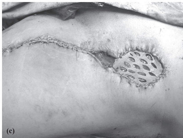
Fig. 2. (a) Recurrent sarcoma in the left inguinal region. (b) Inferiorly based RAM flap, being prepared to address the dead space. (c) The definitive repair is made with a split thickness skin graft overlying the muscle flap transposed to the defect, perioperative view.

logical follow-ups, a relapse with an invasion of the femoral artery and vein was seen. A surgical therapy was planned, which included a wide resection, followed by resection of the femoral artery and vein 15 cm along its course down the inguinal ligament, and revascularization with a 20 cm graft obtained from the great saphenous vein. In order to address the vast dead space occurring after the oncologic resection and to cover the exposed femoral vascular repair with an abundant soft tissue mass, an inferiorly based RAM flap was planned.