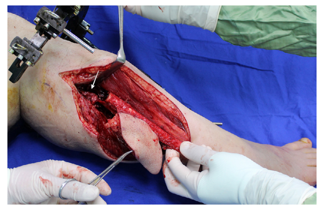
Figure 2. A capsule with a fibrotic appearance (white arrow) was observed on the peroneal pedicle, adjacent to the fracture line. At this level, total dissection of the capsule with pedicle was preferred.