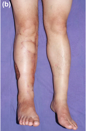
Figure 3. Six months after "double-barrel" repair with an anterograde pedicled osteoseptocutaneous fibula flap and 2 months after removal of fixator and repair with internal fixation. (a) The appearance of the wound and repair at 8 months postoperatively (b) .