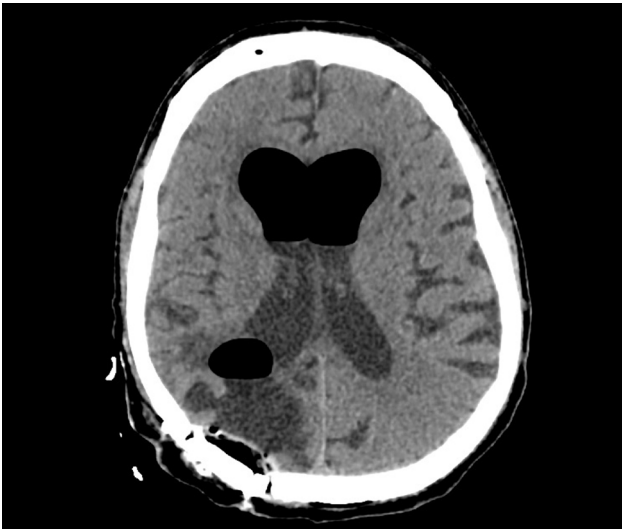
Figure 2. Axial CT scan of a patient who underwent CLD for post-traumatic CSF fistula and pneumocephalus in the lateral ventricles and post-traumatic encephalomalacia in the right occipital region are apparent.

fistula secondary to posterior fossa tumor surgery. Thus, the infection rate was 14.28% in CLD cases secondary to post-traumatic CSF fistula. In addition, the mean CSF glucose was 50.7 mg/dl, and the mean CSF protein was 146.14 mg/dl in post-traumatic CSF fistula cases (Table 1).