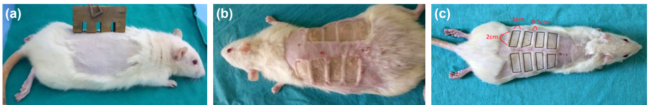
Figure 1. (a-c) The probe that was used in the comb model and the dorsum of a rat after burn. (a) The probe that was used in the comb model. (b) The burn-injured areas. (c) Size of burn areas.