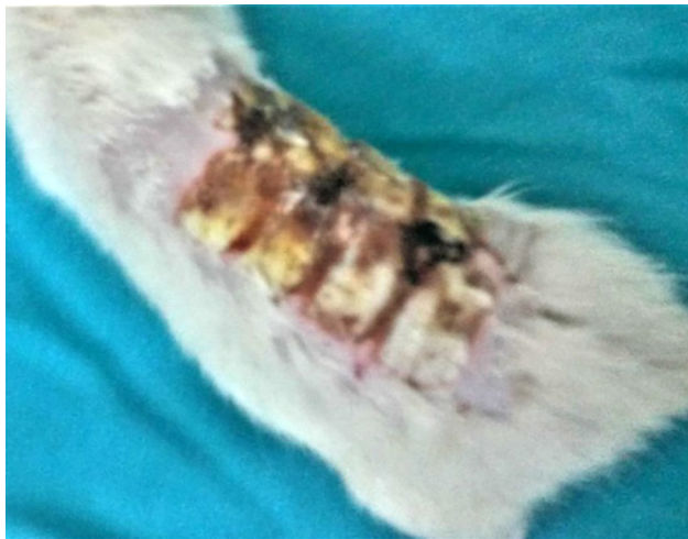
Figure 2. The final burn scars at the time of the sacrifice.

Tissue samples were homogenized with a tissue homogenizer (Bioprep24, Allsheng). Homogenized samples were first centrifuged at 2500 g at + 4°C for 10 min (Hermle Z326K). After centrifugation, the supernatant was centrifuged again at 20000g for 20 min at + 4°C to obtain samples.