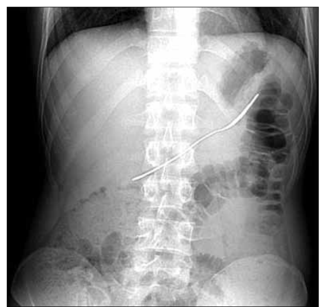
Fig. 1. A plain abdominal radiography showing the dinner fork in the patient's stomach.

metallic foreign body was suspended by the pylorus. Endoscope could not be passed through the duodenal lumen. Endoscopic removal of the fork from the stomach could not be achieved. Therefore, the patient was scheduled for emergency surgical exploration. The abdomen was explored via upper midline incision. The outer layer of the stomach was normal, but there was a huge hard mass filling the whole cavity of the antrum and duodenum. With a longitudinal gastrotomy in the greater curvature, the stomach was opened. At the operation, we determined that the blunt end of the fork passed through the duodenum, and that the sharp end of the fork was suspended by the pylorus. The fork was removed from the stomach (Fig. 2). Following the removal of the fork, the gastric mucosa was examined thoroughly, and hemorrhagic mucosal erosions were observed in the antral region. After saline irrigation, the stomach was repaired in two layers. A nasogastric tube was inserted. A liquid diet was started on the fourth day, and he was discharged six days after the operation. The patient's postoperative period was uneventful.