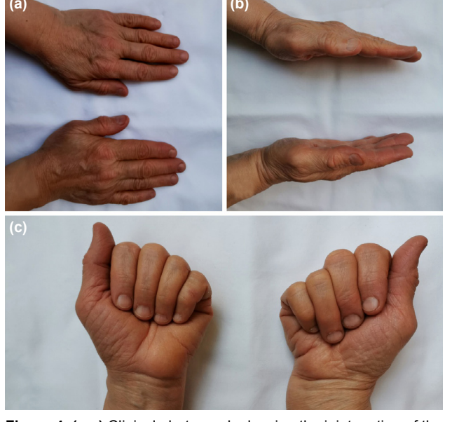
Figure 4. (a-c) Clinical photograph showing the joint motion of the right-hand ring finger at the 42<sup>th</sup> month of the patient.