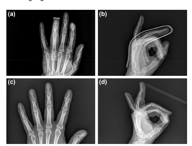
Figure 2. (a) An anteroposterior radiographs after reduction, (b) a lateral radiographs after reduction, (c) an anteroposterior radiographs after the aluminium finger splint was removed, and (d) a lateral radiographs after the aluminium finger splint was removed.

tion, the neurovascular examination was seen to be normal. An aluminium splint was then applied in the "intrinsic plus" position (Fig. 2a and b). On the radiograph taken of the patient, the reduction in both joints was seen to be complete. After 4 weeks, the aluminium finger splint was removed, radiographs were taken of the patient (Fig. 2c and d), and physical therapy was started. In the last follow-up of the patient at the 72th month, her physical examination was performed and her final radiographies were taken (Fig. 3a, b). Patients' painfree range of movement was seen in the proximal and DIPJs with the proximal joint at 0–90° and the distal joint at 0–70° (Fig. 4a-c). No instability was determined in either joint in the coronal plane. In the 72th month, the DASH score of the right hand of the patient was evaluated as 86.