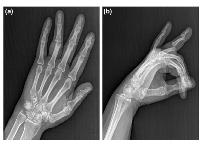
Figure 1. (a) On full anteroposterior radiographs taken of the right-hand ring finger, (b) On full lateral radiographs taken of the right-hand ring finger.

The patient was admitted for treatment. Under peripheral block, by applying hyperextension and traction first to the distal joint then to the proximal joint, closed reduction was applied, and then, the stress test was made on both joints to check stability. In the physical examination made after reduc-