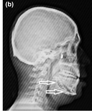
Figure 1. (a) Foreign body and the ultrafragmante sepere deplase fracture in the left mandible (preoperative). (b) Repair with screw implants and mini plate (postoperative).