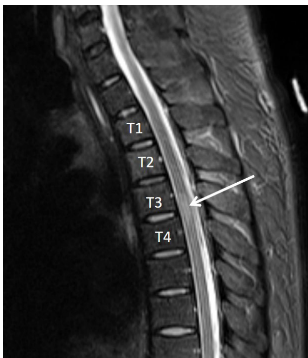
Figure 2. Magnetic resonance imaging of the thoracic spine. White arrow indicates T4 spinal cord contusion.

The patient underwent right upper lobectomy and evacuation of the hemothorax. On the next day after surgery, he was found to be paraplegic. Neurologic examination showed 0/5 muscle power of his lower extremities and loss of sensation below T4. He underwent emergent magnetic resonance imaging of the spine, which showed T4 spinal cord contusion (Fig. 2). We consulted a neurosurgeon who suggested non-operative treatment. After 16 days of mechanical ventilation, he was extubated successfully. However, he remained paraplegic and experienced complete sensory loss on follow-up after 6 months.