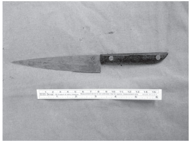
Fig. 2. The retained foreign body: an 18-cm knife.

A retained foreign body carries several risks to the patient. The implanted foreign bodies are highly susceptible to pyogenic infections, and the infections are resistant to antibiotic therapy before the foreign bodies are removed. [3] Aside from possible infections, the