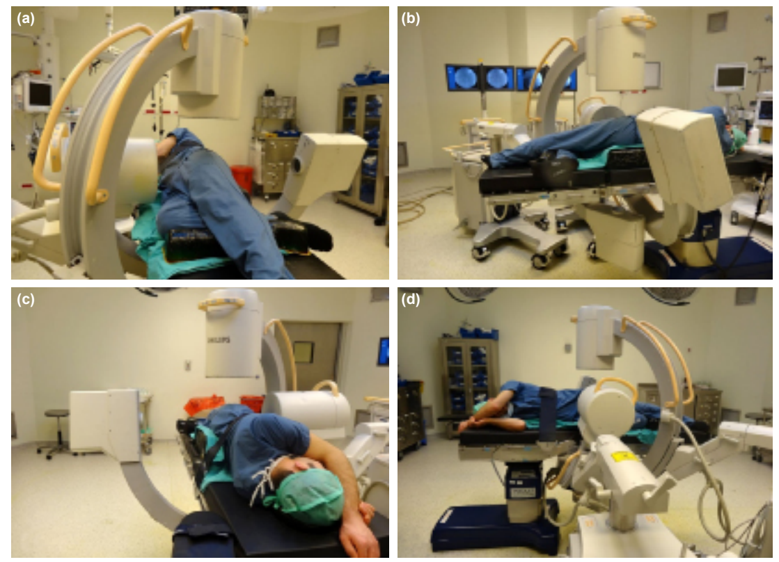
Figure 1. (a-d) To prevent the superposition of both hips, the patient is positioned on the operating table in a 70° oblique position.