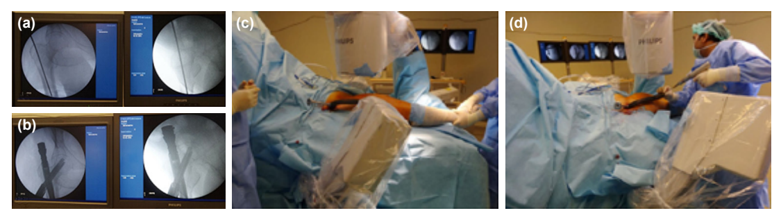
Figure 2. (a-d) The position of the fluoroscopes and anteroposterior-lateral images taken during surgery.