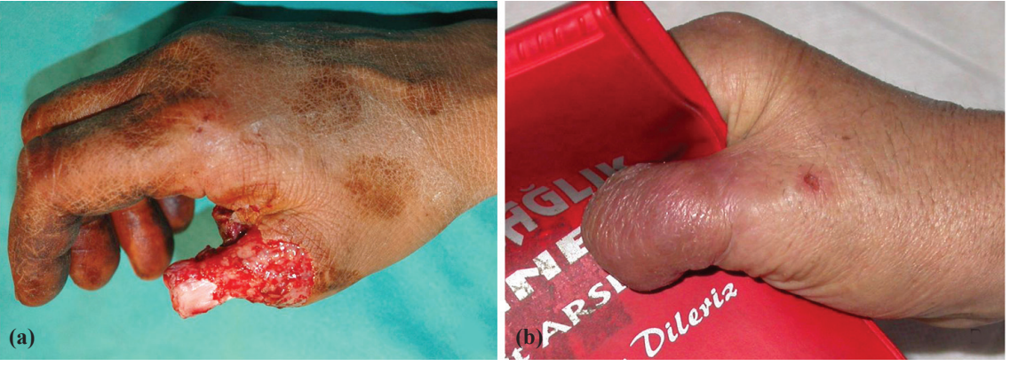
Fig. 4. Preoperative (a) and postoperative (b) appearance of Case 11. (Color figures can be viewed in the online issue, which is available at www.tjtes.org)

penditures due to physical disabilities.<sup>[2,12]</sup>