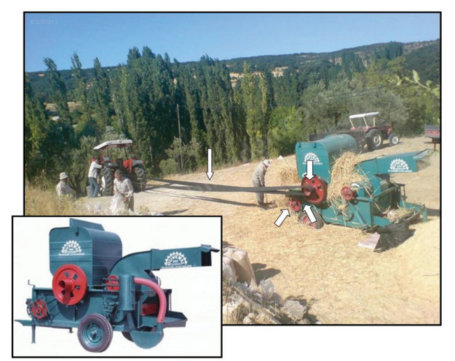
Fig. 1. The threshing machine. The arrows indicate the parts of the machinery responsible for injuries.

The number of patients in each injury group is given in Table 1. One of the patients was female, while the remaining 24 were male. Fifteen of the patients were children (under 15 years of age) and 10 were adults (Table 2). The mean hospitalization time of the patients was 4.0 (1-26 days) days. The most commonly