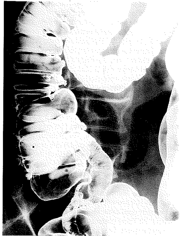
Fig. 2: This barium enema study demonstrated several right-sided Diverticula

general purpose collimator. The patient was placed under the dedector in supine position. After radiopharmaceutical was injected as an IV bolus injection, dynamic images were obtained for first 2 minutes, then 1 minute images were obtained at 5, 10, 15, 30 minutes, 1 hour, 6 hour and 24 hour. There was no evidence of gastrointestinal bleeding in the early images. But at the 6 th and 24 th -hour images, activity was observed in the cecum and ascending colon suggestive of intermittent