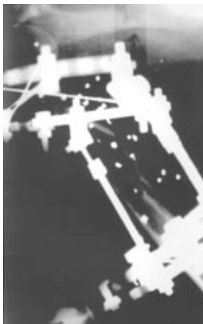
Figure 2: Anteroposterior radiogram of the humerus taken after application of the Ilizarov frame.