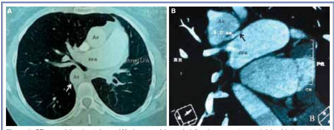
Figure 1. CT scan of the chest shows: (A) absence of the main left pulmonary artery and right-sided aorta (white arrow). The main pulmonary artery measures 36 mm. (B) Long tract patent ductus arteriosus (black arrow, width: 5 mm). Ao: Aorta, RPA: right pulmonary artery, LPA: left pulmonary artery.

Multiple MAPCAs originating from the descending aorta and supplying the left lung were identified by selective angiography (Figure 2b).