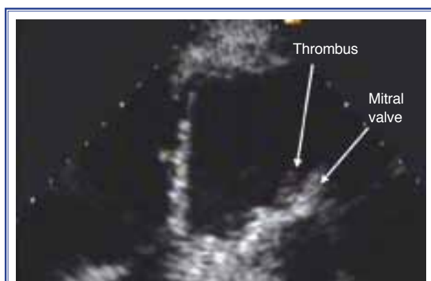
Figure 3. The TEE view of Case 3 demonstrating a thrombus on the left atrial aspect of the mitral prosthesis.

Case 3 – A 25-year-old female with rheumatic mitral stenosis and regurgitation had undergone surgery nine years before for MVR with a bileaflet MHV (Sorin 27 mm) for mitral valve. She was admitted with New