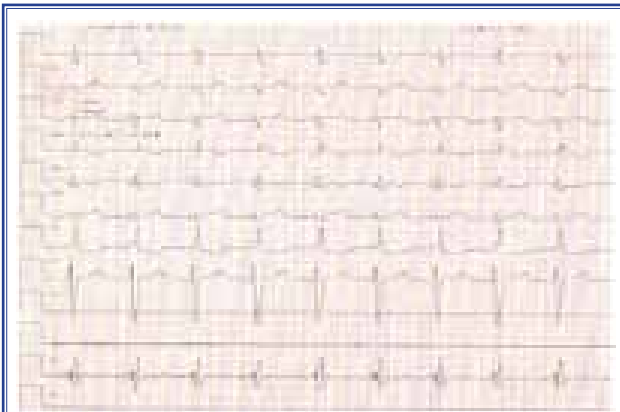
Figure 3. Transesophageal electrophysiologic study showed absence of atrial electrical activity in basal state.

considered, and transesophageal electrophysiologic study was performed to ascertain the cause for absent P waves and the junctional rhythm. No atrial electrical activity was recorded in basal state (Fig. 3). Cardiac catheterization accompanied with transesophageal echocardiography was performed, with the following findings of mean pressures (mmHg): pulmonary artery 23, left atrium 8 and descending aorta 66. The ratio of pulmonary to systemic flow ( Q_p/Q_s ) was found to be 2.77. Atrial septal defect was closed with 9 mm Amplatzer Septal Occluder ® .