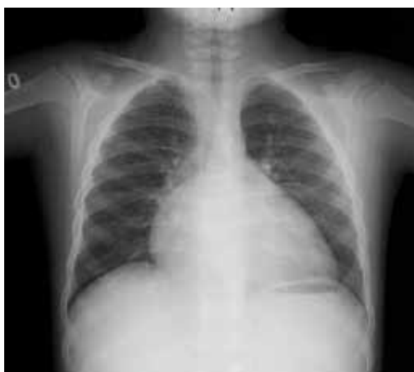
Figure 4. Chest X-ray after transvenous closure of atrial septal defect demonstrating cardiomegaly.

Twenty-four hours after the procedure, hepatomegaly, mild tachypnea and tachycardia were noted. On auscultation of lungs, bilateral fine crackles were detected and cardiomegaly was present in the chest X-