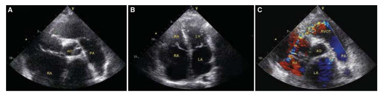
Figure 2. (A) Transthoracic echocardiographic short-axis images showing increased tissue density in the right ventricle and (B) significant dilatation in the right heart chambers. (C) Color Doppler image suggesting narrowness in the right ventricle due to increased tissue density.

monstrated by transesophageal echocardiography. Congenital heart pathologies were excluded by transthoracic and transesophageal echocardiography, while MRI confirmed the present findings with increased tissue density in the right ventricle and significantly dilated right atrium (Figure 3). The right ventricular pressure was measured as 92/13/20 mmHg (systolic/diastolic/enddiastolic) during right heart catheterization. However, measurement of pulmonary artery pressure was discontinued when the patient developed monomorphic ventricular tachycardia while advancing the catheter through fibrotic tissue which led to narrowness in the right ventricle. Right ventriculography also demonstrated narrowness in the right ventricle. Infiltrative diseases, storage diseases, conditions leading to endocardial involvement (history of hypereosinophilic syndrome, drug use, and radiation, etc.), familial cardiomyopathy, collagenous tissue diseases and diabetes mellitus, which may be among the reasons for restrictive cardiomyopathy were excluded by transthoracic and transesophageal echocardiography, MRI, upper abdominal ultrasonography and laboratory analysis.