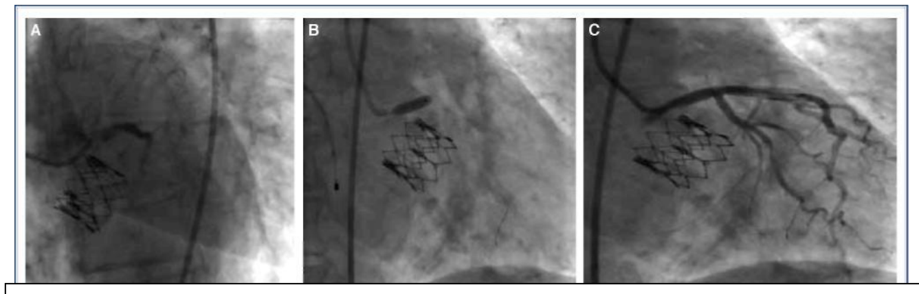
Figure 2.(A) Nearly complete occlusion of the the left main coronary artery orifice (B) stentin procedure, and (C) control angiogram

Following implantation of the aortic valve, ST – segment elevation, and serious hypotensive episode occurred which necessitated application of control coronary artery angiography which demonstrated nearly complete occlusion of the left main coronary artery (Figure 2a). Then, firstly the left main coronary artery was dilated with a 2.75 x 20 mm sized balloon, and a 4.5 x 9 mm bare metal stent was implanted (Figures 2b, and c). After stenting, patient's hemodynamic state improved markedly, and on ECG, ST-segment returned to isoelectric line. Following procedure, access site into the left main coronary artery was closed with XL percutaneous sutures.