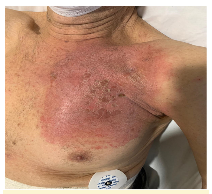
Figure 1. Late-term allergic reaction image in a patient with a permanent pacemaker.

implanted (Figure 1). There were no signs of abscess, discharge, or fluctuation in the area. The patient's patch test is negative. In a laboratory revealed the following: hemoglobin 13 g/dL (11.7–15.7 g/dL), hematocrit 41%, platelet count 178 000/mm³ (150 000–400 000/mm³), white blood cell 4800/mm³ and C-reactive protein <0.3 mg/dL (0–0.5 mg/dL), normal temperature and negative blood cultures. In the superficial ultrasonography of the patient, an appearance compatible with the foreign body reaction extending along the permanent pacemaker electrode was detected. There was no finding in favor of abscess. Infective pathology was not considered in the patient by the infectious diseases clinic.