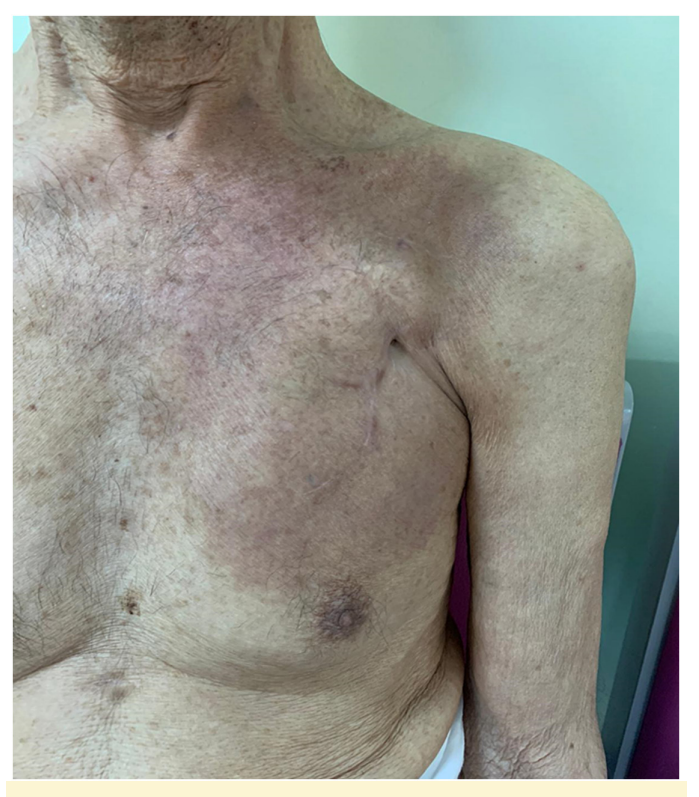
Figure 2. Image of the pacemaker area after topical treatment.