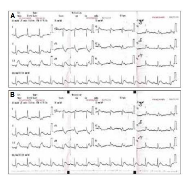
Figure 1. Electrocardiography. Sinus rhythm HR, 55/bpm STelevation in leads D2, D3,and aVF; ST-depression in leads, V2-V6; since septal electrical activation is from right to left, Q wave is observed in leads V1-V3. In leads V5-V6 (A), posterior elektrokardiography: Sinüs rhythm HR, 59/bpm ST-ellevation; in leads, D2-D3-AVF, and V7-V8-V9 (B).

At the same session drug-eluting stent was implanted into Cx through percutaneous angioplasty (Figure 2). After the procedure the patient was brought into coronary intensive care unit. During their follow-up the patient maintained a stable hemodynamic state, and on his transthoracic echocardiogram a trabeculated systemic ventricle, a moderator band were observed. Besides a morphologic right ventricle (RV) was seen in normal anatomical location of the left ventricle ) and vice versa).