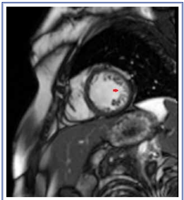
Figure 2. Cardiac MRI was consistent with LV noncompaction.