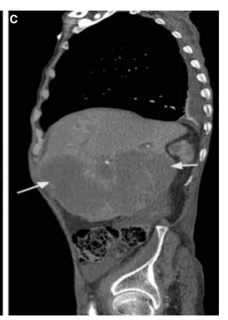
Figures— (A) Inspection of the abdomen showing liver line enlargement. (B) Computed tomography in coronal plane showing massive liver hematoma (arrow). (C) Computed tomography in sagittal plane showing massive liver hematoma (arrow).