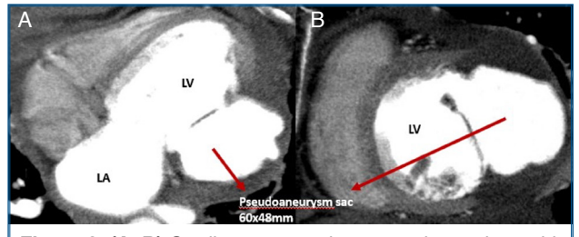
Figure 3. (A, B) Cardiac computed tomography angiographic image of the 60 \times 48 mm pseudoaneurysm sac.

to the development of systolic heart failure, ventricular pseudoaneurysm, and severe mitral regurgitation and was included on the transplant waiting list. Echocardiography revealed very low ejection fraction, restrictive type diastolic dysfunction, and the pseudoaneurysm sac. In addition, the inferoposterior region pseudoaneurysm sac caused mitral valve posteromedial papillary muscle structure distortion, and eccentric severe mitral regurgitation was detected (Figure 2A-B). CCTA was performed, and ventricular pseudoaneurysm formation of 85×60×90 mm size was detected (Figure 2C). The patient's symptoms of hypervolemia and heart failure were controlled with medical treatment, and she was discharged. The patient is still alive and waiting for cardiac transplantation.