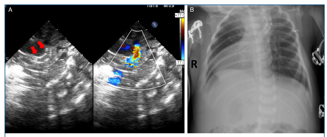
Figure 3. (A) 2D and color Doppler images of the echocardiography after PDA stenting, and (B) Chest radiograph after PDA stenting CTA: computed tomography angiography; PDA: patent ductus arteriosus.

Newborns with duct-dependent pulmonary circulation or inadequate pulmonary blood flow have traditionally been treated with a surgical shunt or have undergone early primary repair. Early primary repair is less preferred owing to the high risk of morbidity and mortality. However, systemic-pulmonary artery shunt operation may progress with significant complications, especially in premature babies. Shunt thrombosis, shunt stenosis, pulmonary or systemic arterial distortion, diaphragmatic paralysis, pleural effusion, and excessive or asymmetric pulmonary blood flow are among the most common complications.<sup>[3,7,8]</sup> Prevention of occlusion of the ductus arteriosus was considered a reasonable alternative to surgical aortopulmonary anastomosis at the end of the 1970s. In 1992 Gibbs et al.<sup>[9]</sup> described PDA stenting technique as an alternative to the systemic-pulmonary shunt. Since then, stenting of PDAs has gained increased popularity.<sup>[7]</sup>