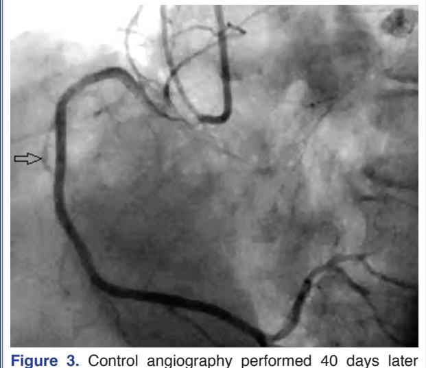
showing the arteriovenous fistula draining to the right ventricle cavity (black arrow).

Forty days after the recent intervention, the patient underwent PCI for 70% stenosis in the LAD artery stent. A 2.75x18-mm DES was deployed at 18 atm of pressure. The stent graft was patent on RCA control fluoroscopic imaging, but an arteriovenous fistula (AVF) connecting to the RV had occurred and there was a shunt from the RCA to the RV (Figure 3, Video 4<sup>*</sup>). The patient was discharged with medical therapy. We did not perform an ischemia study because there was no active cardiac complaint at the 1-month follow-up visit.