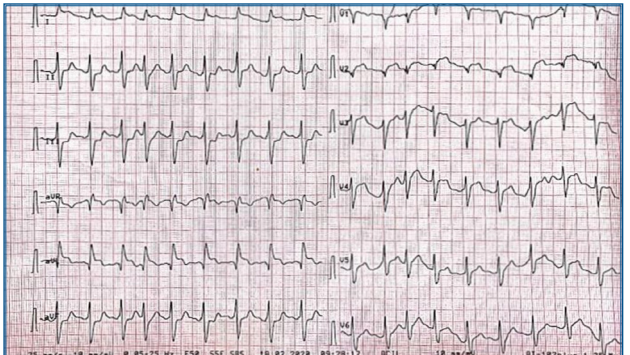
Figure 1. Electrocardiogram of the patient represents ST segment elevation in leadsDI, aVL, V2, V3, and V4 and reciprocalST segment depression in leads D3, aVF. Rhythm is atrial fibrillation.

I >500.000 ng/mL (reference range: 0.000-0.034). Written informed consent was obtained from the patient. The patient was then initiated on oral antiplatelet therapy (acetylsalicylic acid 300 mg and clopidogrel 600 mg) and underwent coronary angiography. The proximal left anterior descending (LAD) artery was completely occluded by a fresh thrombus (Video 1* and Figure 2A). A drug-eluting stent was implanted in the LAD lesion, and the subsequent angiography showed thrombolysis in myocardial infarction flow grade 3 (Video 2* and Figure 2B). Due to persisting abdominal symptoms following coronary revascularization, the presence of AF with a high CHA<sub>2</sub>DS<sub>2</sub>-