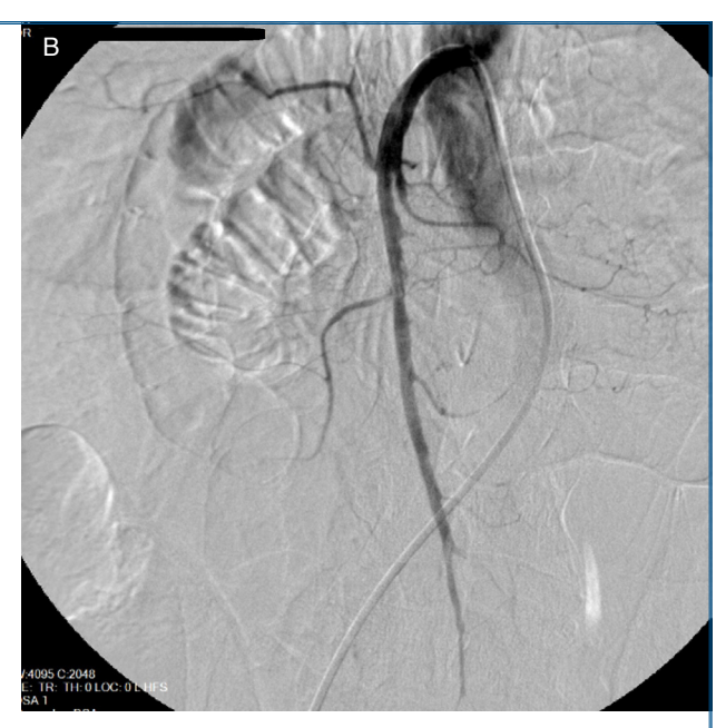
Figure 3. (A) Total occlusion of the superior mesenteric artery (SMA) (black arrow). (B) After balloon angioplasty of the SMA, the vessel was opened but tissue perfusion was suboptimal (not shown).

are 2 published case reports of synchronous acute myocardial infarction and mesenteric ischemia, and AF has also been reported in these 2 cases, similar to our report.