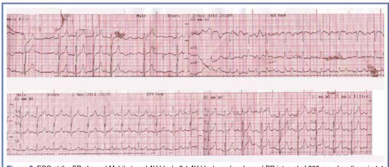
Figure 2. ECG at the ED showed Mobitz type I AV block, 2:1 AV block, and prolonged PR interval of 200 ms when there is 1:1 AV conduction.

therapeutic, or even sub-therapeutic drug levels.<sup>[2]</sup> The latter group is reported to consist almost exclusively of elderly women.<sup>[2]</sup> As in our case, AV block can develop after long periods of therapy. Therefore, the evaluating cardiologist may overlook the association of this drug with AV block, which is mostly prescribed by neurologists.